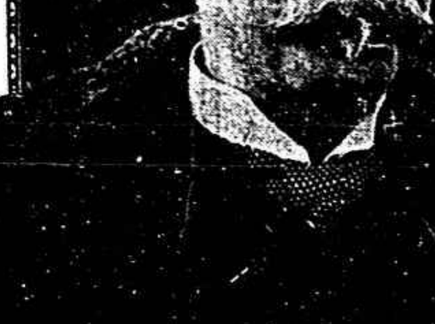
SIR THOMAS LIPTON